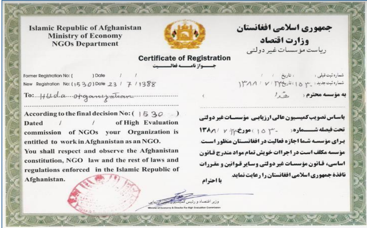
HUDA Reg, With MAIL